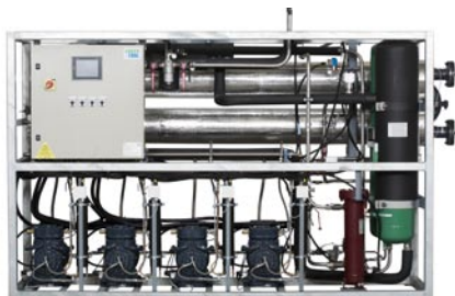
BALTIC 460 LT